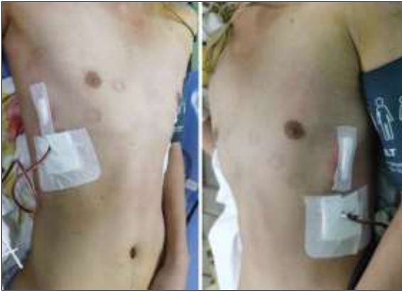
Fig 4: Appearance of chest wall after operation