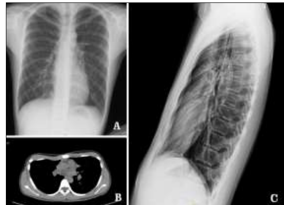
Fig 2: Imaging examination. A. The X-ray posteroanterior film showed that the costal space was widened; B. CT scanning cross-section showed that the anterior and posterior diameter of thorax was shortened; C. The X-ray lateral film showed that the anterior and posterior diameter of the thorax was shortened