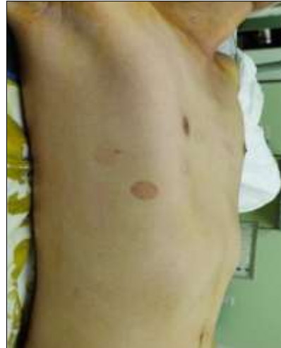
Fig 1: Appearance of chest wall before operation

Flat chest is a special thoracic deformity, but cannot be corrected by standard Nuss procedure. We used a combination of two surgical methods to perform the treatment, giving full play to the advantages of template plastic surgery, and finally corrected the deformity. Our experience shows that this method is simple and effective for the treatment of flat chest.