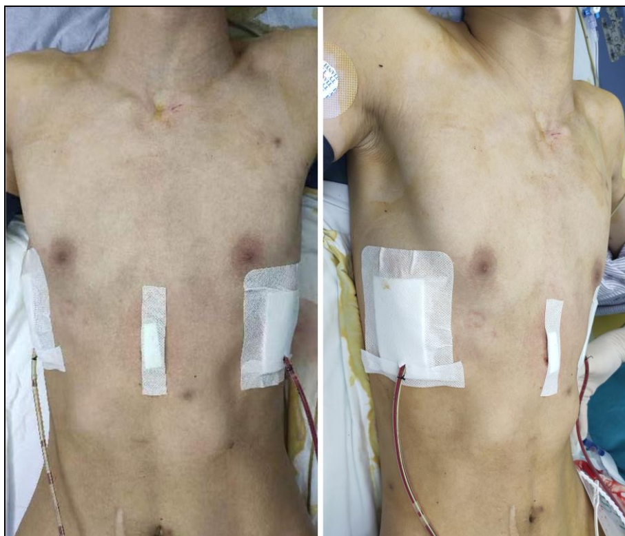
Fig 3: Appearance of chest wall after operation.