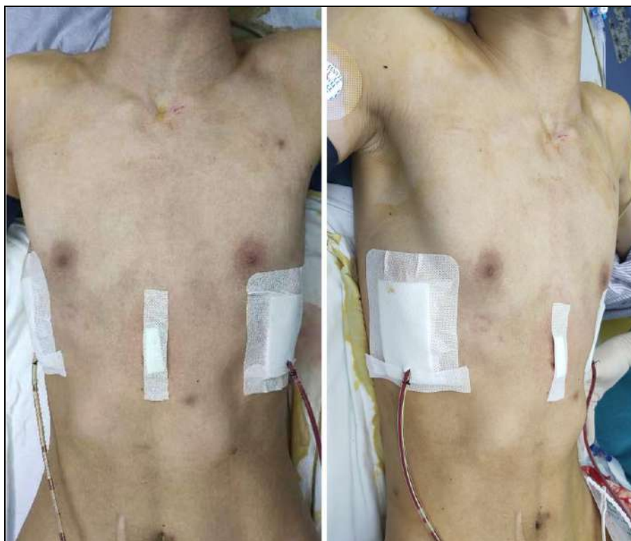
Fig 3: Appearance of chest wall after operation.