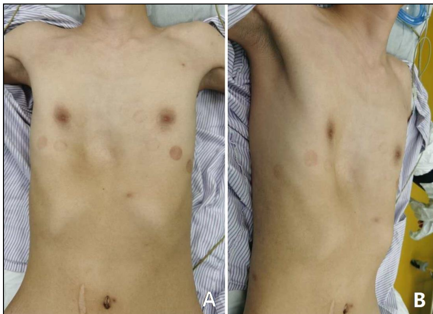
Fig 1: Appearance of chest wall before operation.

At present, there are many treatment methods for asymmetric pectus excavatum. Some authors use asymmetric steel bar for treatment, which can have a good short-term effect, but the long-term effect cannot be guaranteed. The method we designed is different from that of other authors. Due to the obvious increase of the area acted by the steel bars, the effect is more accurate and reliable. In general, our method provides an effective solution for the correction of asymmetric pectus excavatum.